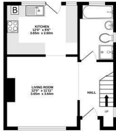
GROUND FLOOR 354 sq ft. (32.9 sq.m.) approx.